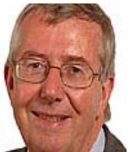
Lord McKenzie of Luton, minister for health and work Department of Work and Pensions